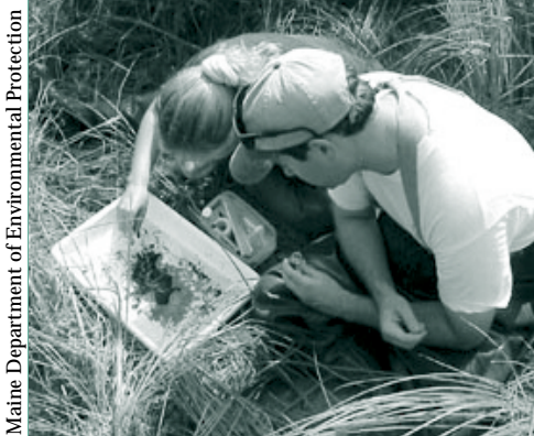
Maine Department of Environmental Protection